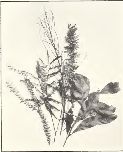
ACACIA CULTRIFORMIS ACACIA BAILEYANA ACACIA SALIGNA ACACIA EXTENSA